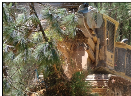
High lift boom system