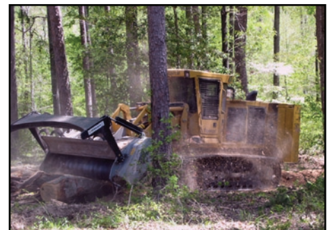
Compact and manoeuvrable